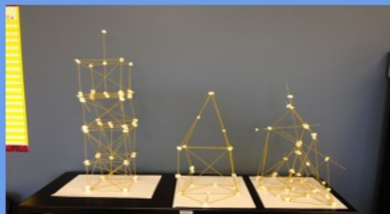
Earthquake Proof Buildings?